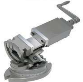
B12. 3-Axis Tilting Vice