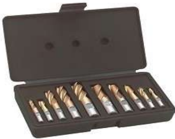
B05. HSS End Mill Set