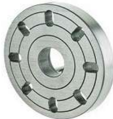
A10. Face plate