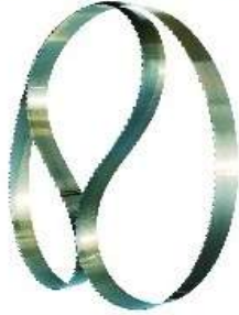
C02. Saw Band