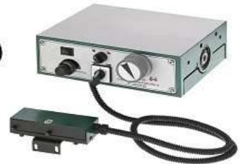
B08. Power Feed