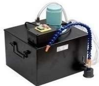
B19. Coolant Pump System