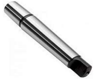
C04. Morse Taper