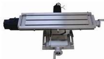
D03. Cross Table with Stepper Motor