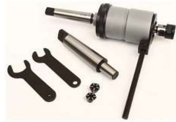
B04. Reversible Tapping Chuck