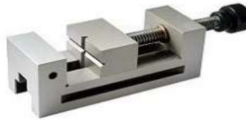
B07. Precision Toolmaker's Vice