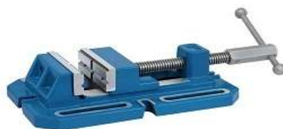
D18. Drilling Machine Vise