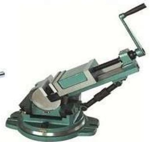
B16. Universal Machine Vice