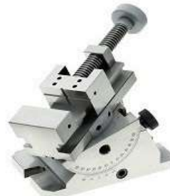
C11. Precision Universal Vise