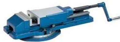
B15. Hydraulic Machine Vice