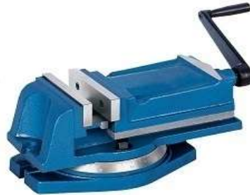
B10. Premium Machine Vice