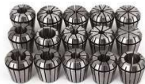
A18. Collet Kit