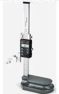
D12. Digital Height Gage