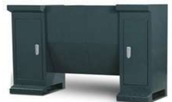
A20. Machine Base