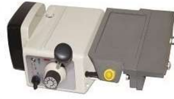
D04. Power Feed