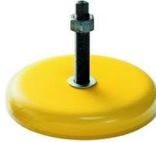
D11. Vibration Damper