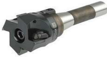
B02. Face Mill