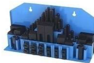
A19. Clamping Kit