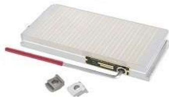
B14. Magnetic Chuck