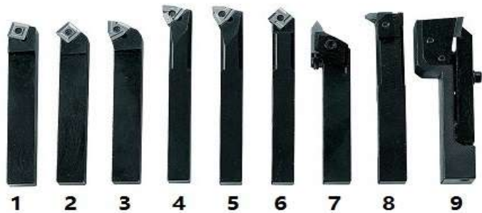
E06. Carbide Turning Tool Set