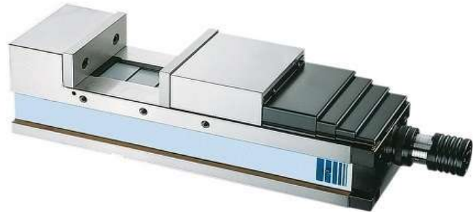
E02. Universal Power Vice