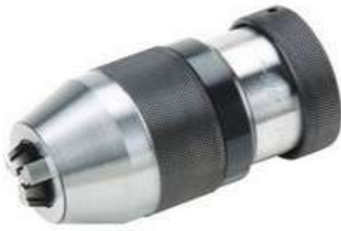
B01. Keyless Drill Chuck