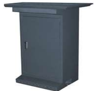
B20. Heavy Stand