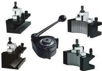
A05. 40 POS. Tool Post Set