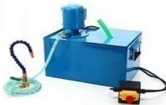
A14. Universal Coolant System