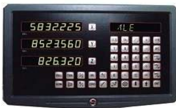
B13. Digital Position Display