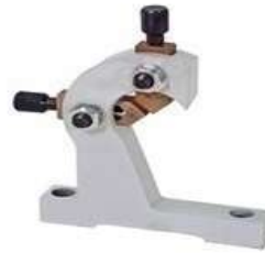
A03. Follow Rest