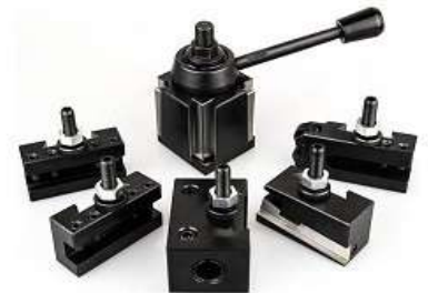
A12. Quick Change Tool Post