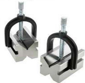
D13. V-Block & Clamp Set