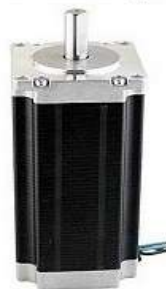
D14. Stepper Motor