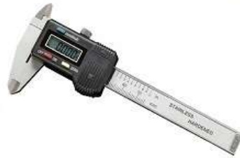
C03. Digital Caliper