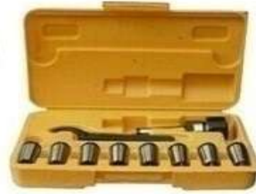
B03. Mill Chuck Set