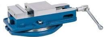
C16. Machine Vise