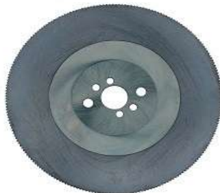
C18. Circular Saw Blade