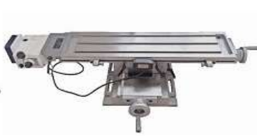
D02. Cross Table With Power Feed