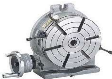
B18. H/V Rotary Table