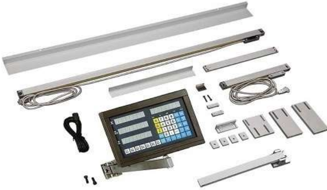
E01. 3-Axis Digital Position Indicator Set