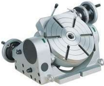
D05. Swivelable Rotary Table