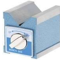
C07. Magnetic V-Block