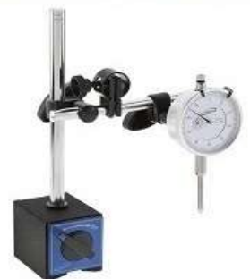
D20. Magnetic Base