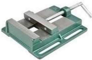
B09. Milling Vice