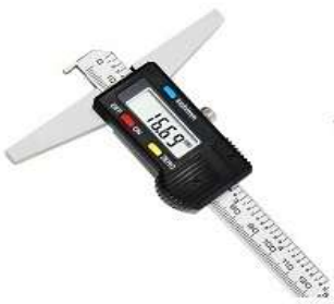
C13. Digital Depth Gage