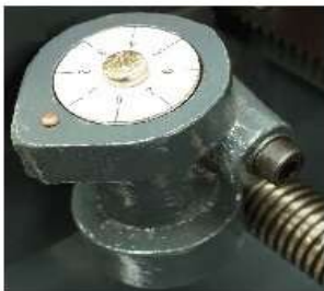
A09. Thread Chasing Dial