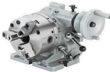
D06. H/V Rotary Table With Chuck