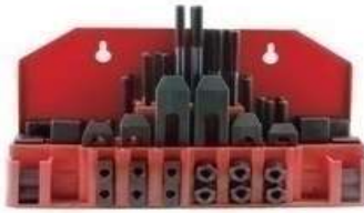
B06. Clamping Kit