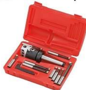
D15. Boring Head Set