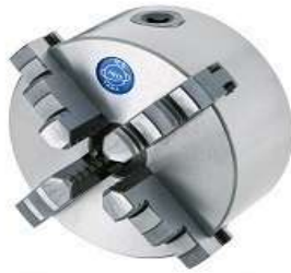
A02. 4-jaw Chuck