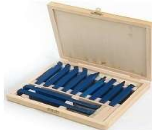
A11. Cutter Set