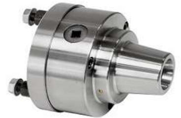
A08. 5C Collet Chuck