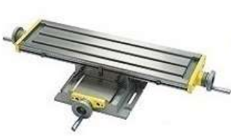
D01. Cross Table