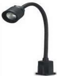
A17. Halogen Lamp