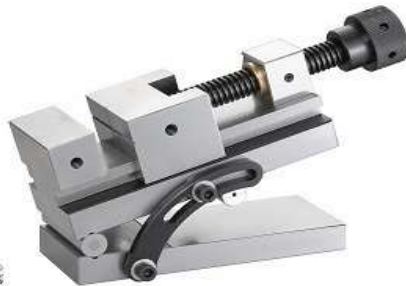
C14. Toolmaker Machine Vise