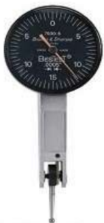
D17. Test Indicator