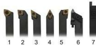
A15. Lathe Tool Kit