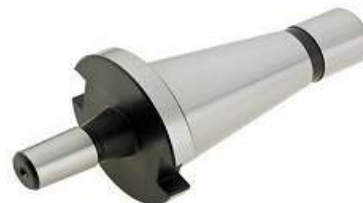
D19. Drill Chuck Arbor