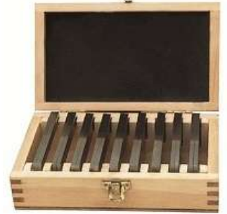
C08. Precision Parallel Block