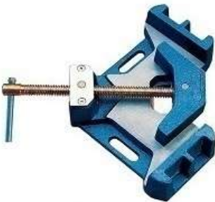
D09. Angle Vise