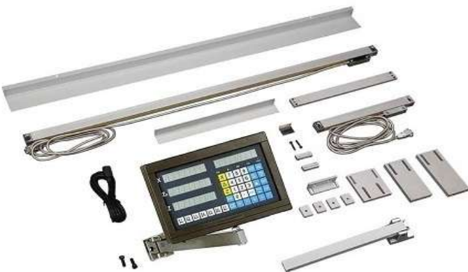
E05. 2-Axis Digital Position Indicator Set