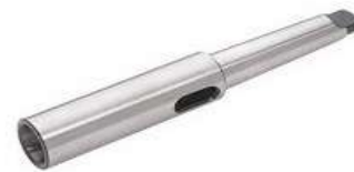
D16. Extension Socket