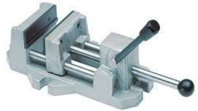
C12. Quick Release Vise