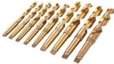
C06. HSS Twist Drill with Morse Taper