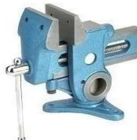
C15. Parrot Vise