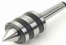
A06. Live Center