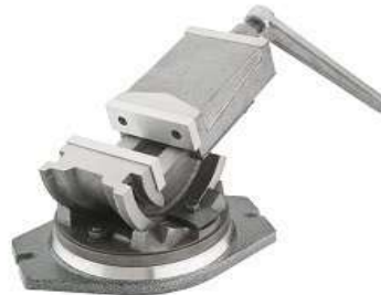
B11. 2-Axis Tilting Vice