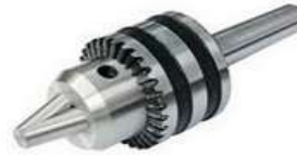
A07. Tailstock Chuck