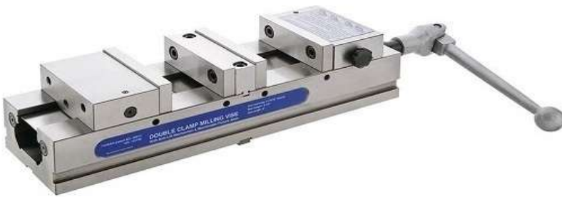
E03. High Precision Double Clamp Milling Vice