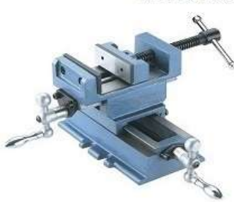
D10. Cross Sliding Vise