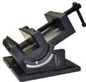
C10. Tilting Angle Vise