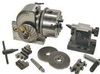
B17. Dividing Head Set