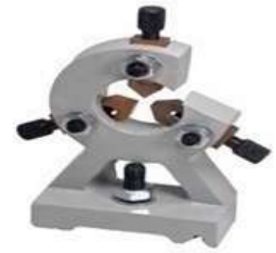
A04. Steady Rest