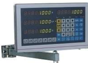
A13. Digital Readout