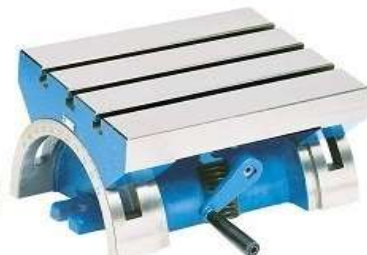
D08. Adjust Swivel Table