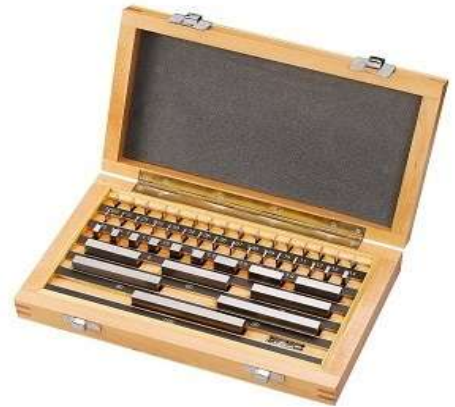
E04. Gage Block Set