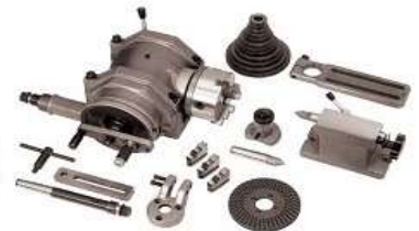
C20. Universal Dividing Head