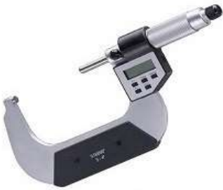
C01. Digital Micrometer