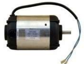
A16. Powerful Motor