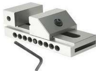
C19. Toolmaker's Steel Vise