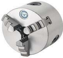
A01. 3-jaw Chuck